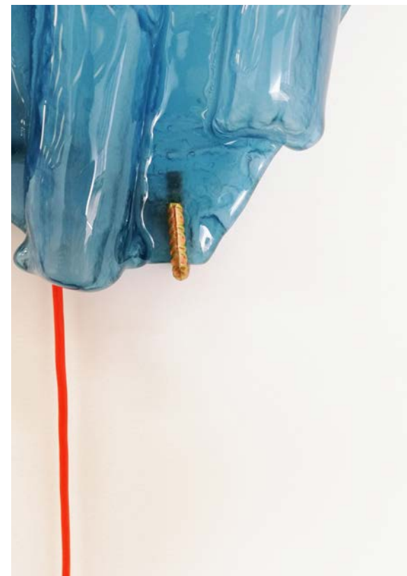
Blue I Float glass, tropicalized iron, led 68H x 48 x 10 cm ca.