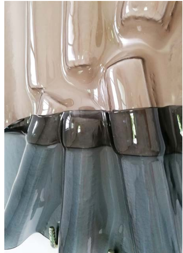
Bi Float glass, tropicalized iron, led 70 H x 45 x 10 cm